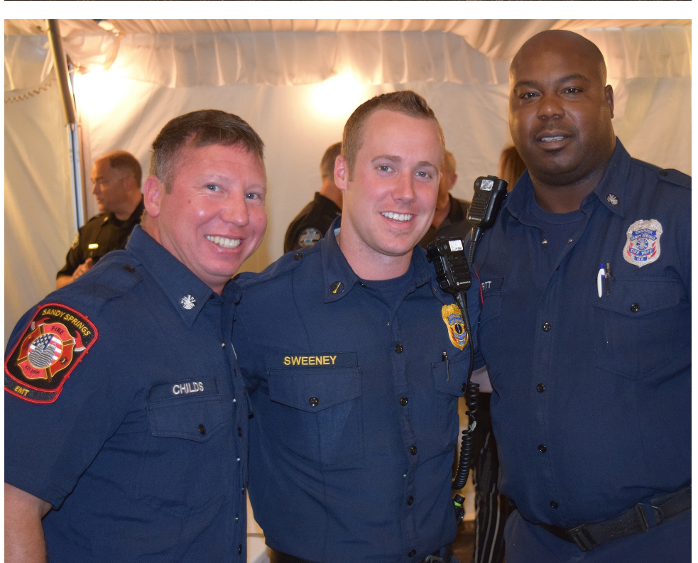
SANDY SPRINGS ROTARY SOCIAL EVENT ON MONDAY, OCTOBER 30TH AT BROOKLYN CAFE BEGINS AROUND 5:30 P.M.