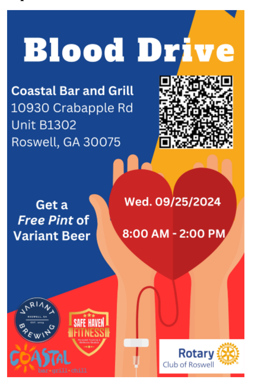
Sept. 25 Blood Drive

Medical Equipment Project Kicks off in Sept!