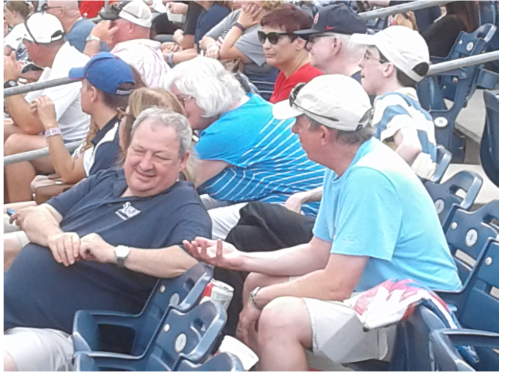
Join your family of Dunwoody: