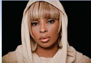
Clockwise: Mary J Blige, Augusten Burroughs, Princess Bride, Chuck Pagano